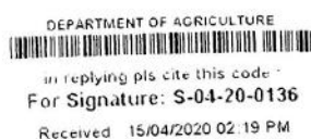
WILLIAM D. DAR, PhD Secretary

A food-secure Philippines with prosperous farmers and fisherfolk