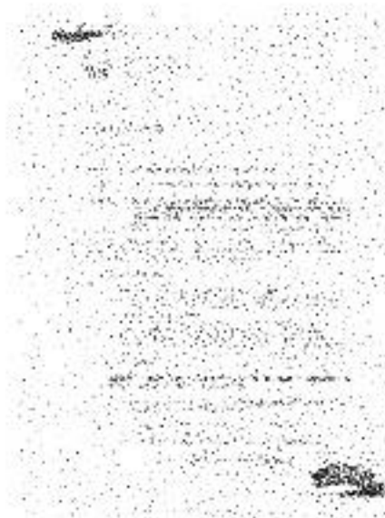
MEMO 45 001.jpg 1170K