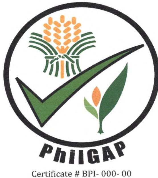
Figure 2. PhilGAP Certified Mark with Certificate Number