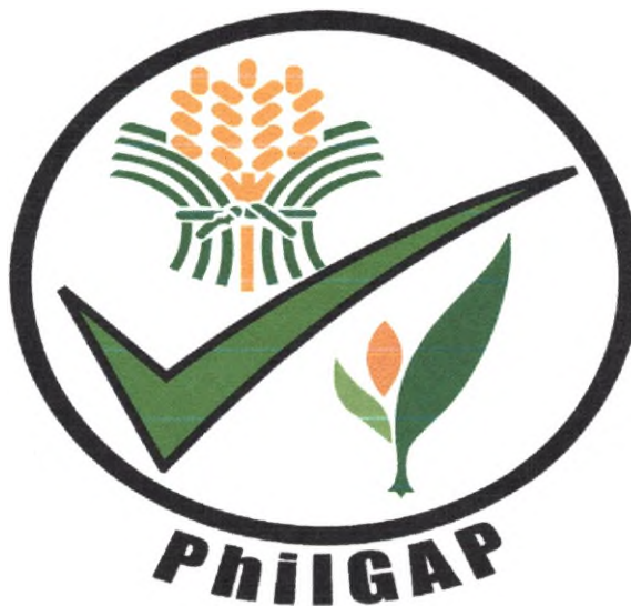
Figure 1. PhilGAP Certified Mark

The PhilGAP Certified Mark (Figure 1) shows the basic design elements of the certification mark, the PhilGAP logo with the text " PhilGAP " situated at the bottom of the circle. The logo of the Department of Agriculture (DA) at the upper left corner of the circle, the logo of the Bureau of Plant Industry (BPI) at the lower right corner of the circle and with the check mark at the center with green color and black line indicating conformities to standards, the DA logo indicating its respective original color of yellow and green; the BPI logo indicating its respective yellow, green and light green and; and black for the circle enclosing the logo and the inscription "PhilGAP". The type face use is Impact Regular for the word "PhilGAP".