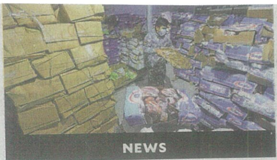
4 warehouse owners sued for smuggling

Panganiban explained that the department was currently focusing on inspecting warehouses and cold storage facilities to assess whether products were smuggled. INQ