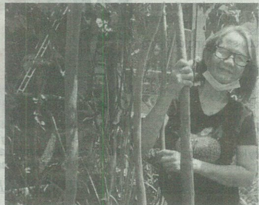
Ang kakaibang variety ng patola na tanim ng mga PWDs.

nilang patola kumpara sa regular na patola na nabibili sa merkado.