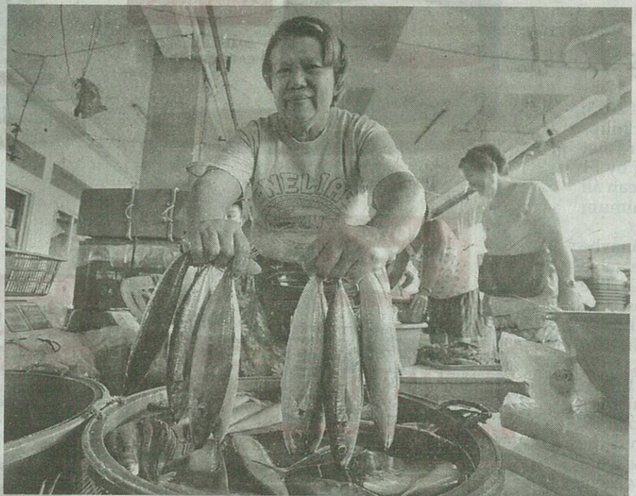
A Bulungan Fish Port vendor in Parañaque shows freshly caught fish from Manila Bay yesterday.

"We support the importation during the closed fishing season from November to January as we don't have much fish production at that time, as long as it is calibrated so that it will not affect the producer of aquaculture and municipal water,"