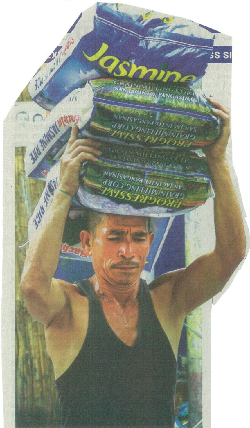
TONS OF RICE — A stevedore unloads sacks of rice on Friday, Aug. 18, 2023 to a warehouse in Tondo, Manila. President Marcos supports the review of the Rice Tariffication Law (RTL) or Republic Act 11203 to restore the regulatory powers of the National Food Authority (NFA) amid issues on rice supply and price increase.