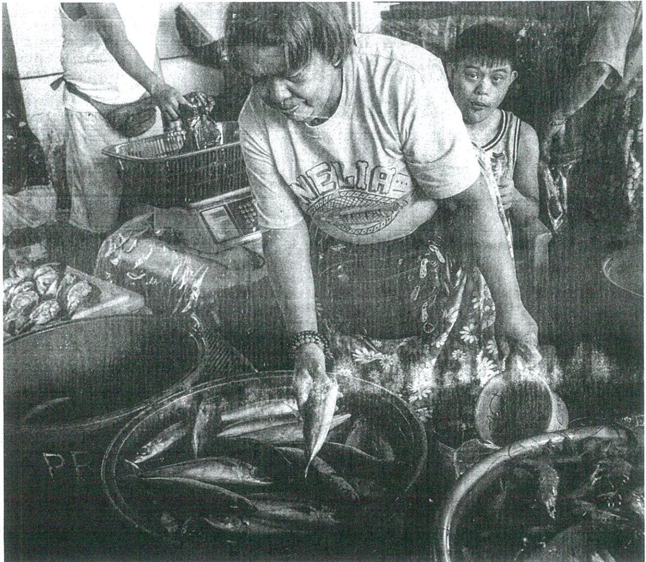
FRESH FISH – Freshly caught fish from the Manila Bay are sorted upon arrival at the Bulungan Fishport in Parañaque City on Friday, August 18, 2023. The Bureau of Fisheries and Aquatic Resources (BFAR) of the Department of Agriculture (DA) will import tons of fish to augment national supply in the last quarter of the year.