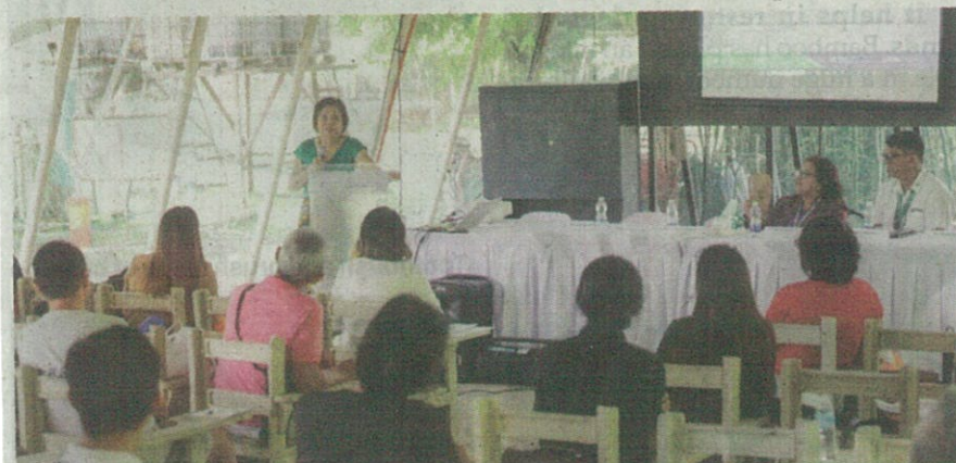
Sen. Villar speaks to a group of trainers during a Training of Facilitators for Farm Business Schools at the Villar SIPAG Farm School in Bacoor.

"But I asked him not to push through with the plan because this is where I want us to retire," notes Sen. Villar. "I've always been a farm girl at heart. I wished my parents didn't sell our farm in Muntinlupa then. Thank