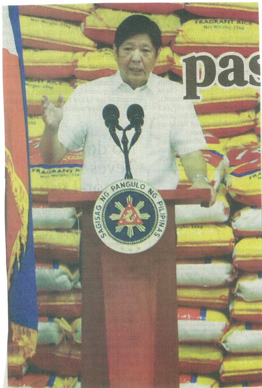
PBBM IN SIARGAO — President Ferdinand R. Marcos Jr. speaks as he leads the distribution of smuggled premium rice seized by the Bureau of Customs to beneficiaries of the Department of Social Welfare and Development's Pantawid Pamilyang Pilipino Program in Siargao Island, Surigao del Norte, on Friday, Sept. 29, 2023.