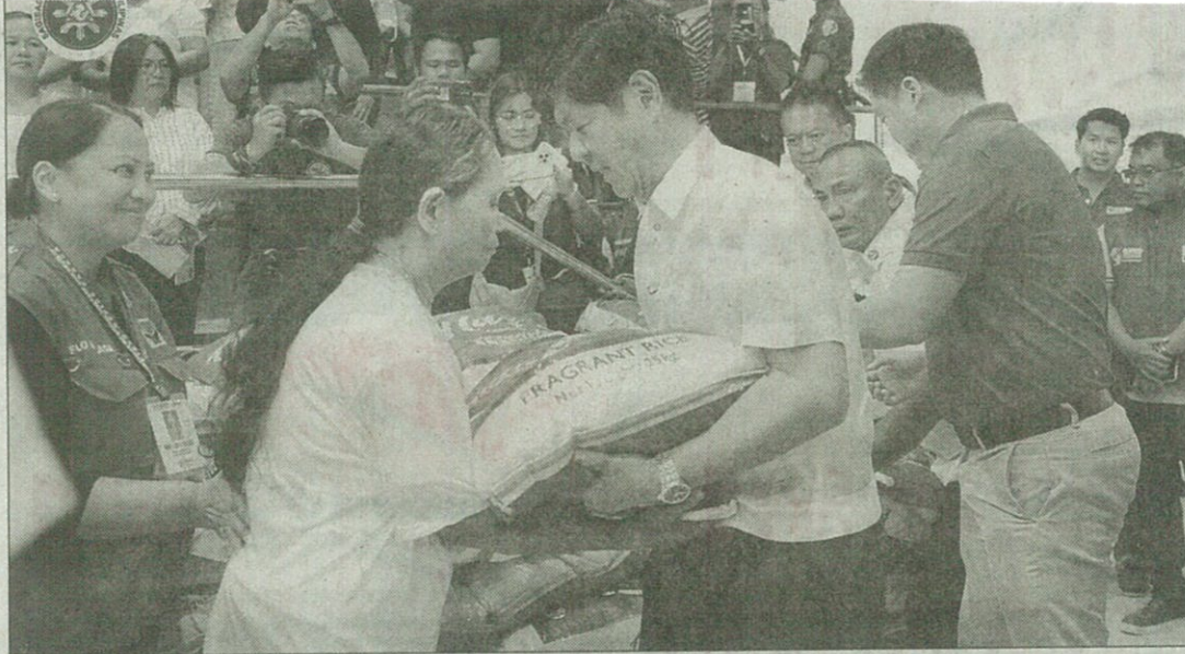
President Marcos leads the distribution of smuggled premium rice, seized by the Bureau of Customs, to beneficiaries of the Department of Social Welfare and Development's Pantawid Pamilyang Pilipino Program in Siargao and Dinagat Islands yesterday.