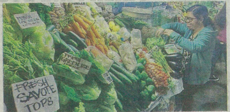
A vegetable vendor in Manila checks the prices on display.

Due to the inflation outturn in August and upside risks, the BSP Monetary Board decided to raise its inflation forecasts to 5.8 percent from 5.6 percent for 2023 and to 3.5 percent from 3.3 percent for 2024.