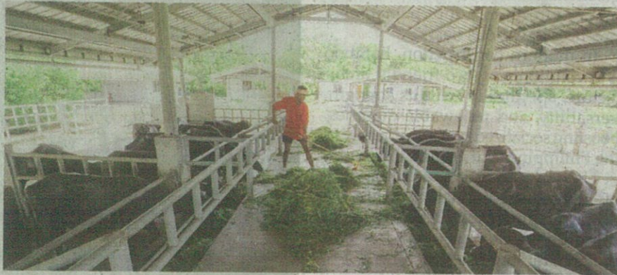
The Villar SIPAG Farm in Bacoor has 50 carabaos who are fed organic Napier grass which are grown in the farm.