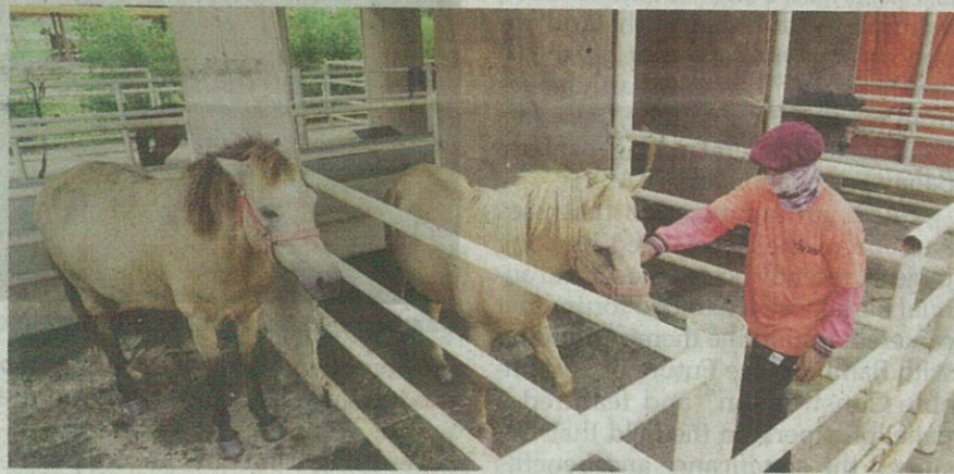
The Villar SIPAG Farm in Bacoor has a Children's Farm with a mini petting zoo for kids to enjoy.

in 2015, and caters to farmers in the National Capital Region (NCR), Southern Luzon, and Bicol. In that year alone, three more were established, one after the other.