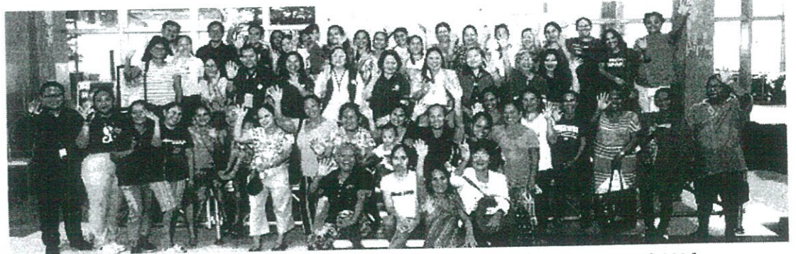
■ SM Foundation welcomes Kabalikat sa Kabuhayan on Sustainable Agriculture Program Batch 291 from Barangay Mambaling in Cebu City.

2007, the vision of Sy Sr. has evolved into a holistic training program that now helps create opportunities and paves the way for skills enhancement, livelihood and employment.