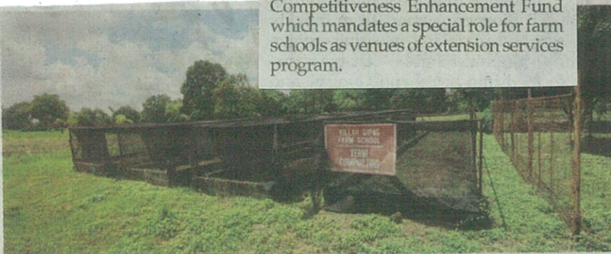
Vermicomposting facility at the Villar SIPAG Farm School in Bacoor

The first Villar SIPAG Farm School, the one in Bacoor, was established