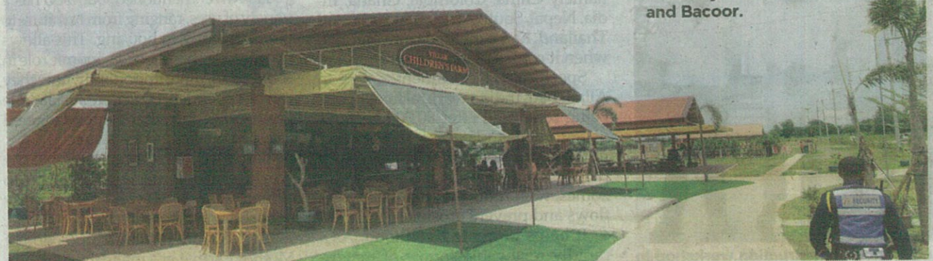
The farm also has dining establishments.