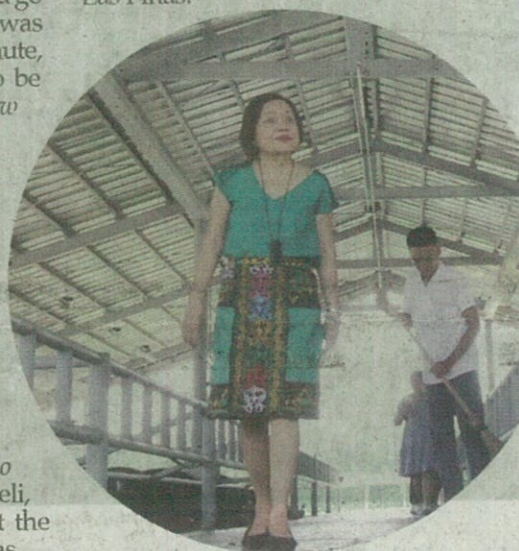
Sen. Cynthia Villar walks past the 50 carabaos on the Villar SIPAG Farm in Bacoor.

The Children's Farm is one of the highlights of the Villar Farm, which is located at the boundary of Bacoor and Las Piñas.