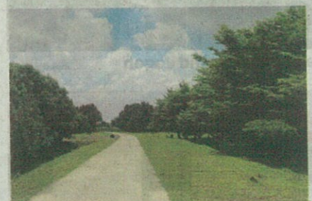
The 150-hectare farm sits on the boundary between Las Piñas and Bacoor.