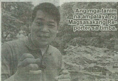
Ang mga tanim na ampalaya ng Magsasakang Reporter sa timba.

Sa mga tanong at komento ay maaari ninyo akong i-text, huwag po tawag, sa 09178675197. STAY SAFE, HAPPY FARMING, GOD BLESS US ALL.