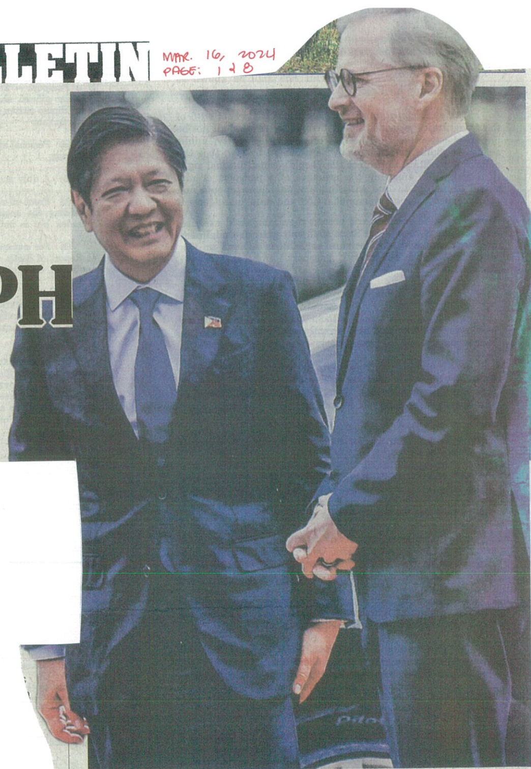
BILATERAL MEETING — President Ferdinand R. Marcos Jr. and Czech Prime Minister Petr Fiala prepare for a bilateral meeting on Thursday, March 14, 2024, where they discussed economic and trade relations between the Philippines and the Czech Republic.

In his remarks, Fiala conveyed to Marcos Czech Republic's readiness to support the Philippines in various sectors, such as agriculture, ►8