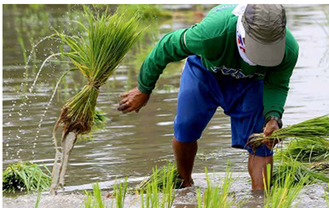
A farmer transplants rice seedlings in Sumapang Matanda, Malolos, Bulacan.

THE Department of Agriculture (DA) said it is finalizing a proposal that will “substantially” increase its budget for 2025 to pursue its goal of modernizing the farm and fisheries sectors to produce more food, ensure food security, and increase incomes of farmers and fishermen.