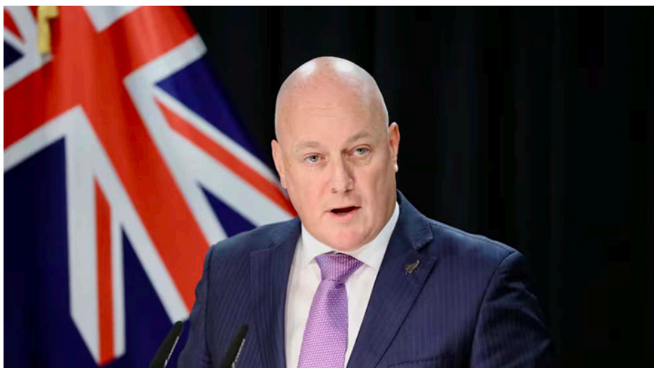
New Zealand Prime Minister Christopher Luxon

THE Philippines and New Zealand have agreed to forge a Comprehensive Partnership by 2026 to mark the 60th year of bilateral relations between the two Pacific nations.