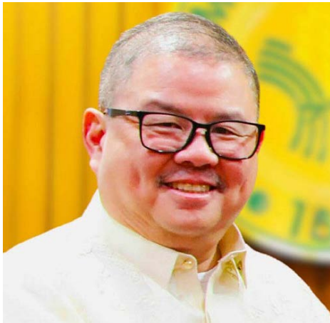
Agriculture Secretary Francisco Tiu Laurel Jr.