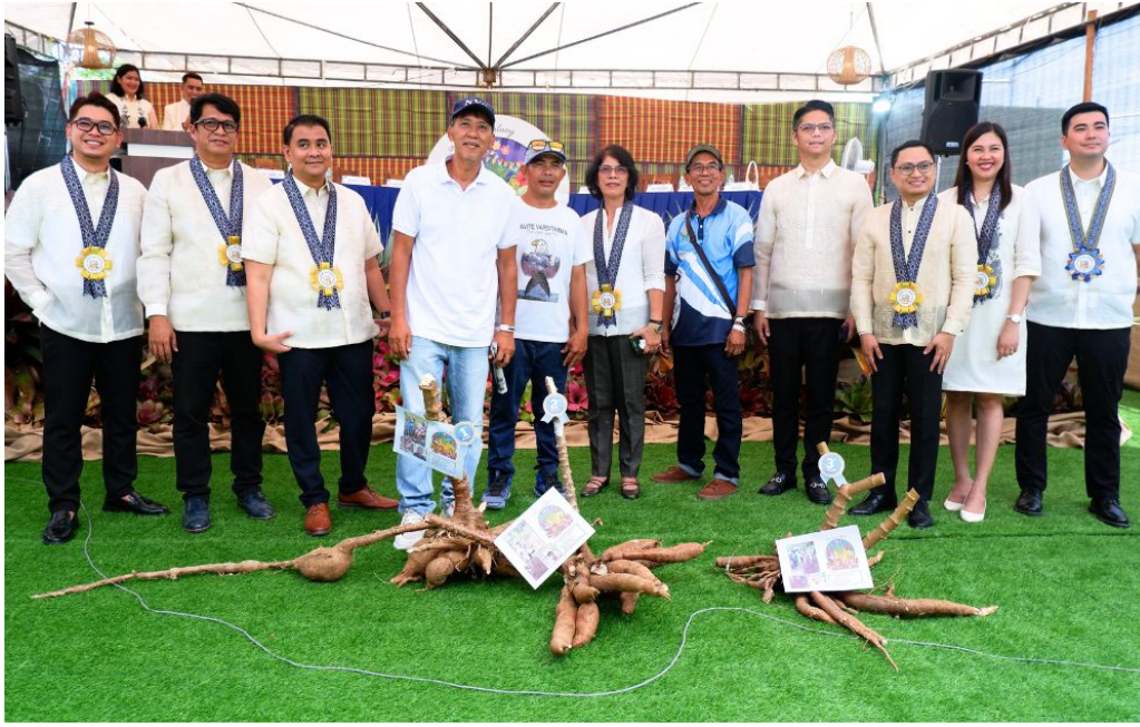
Winners of the biggest harvested cassava awarded at Sumilang Festival in Silang, Cavite, on April 24

Silang Cacao Growers Association, meanwhile, was awarded as Most Outstanding Farmer Association.