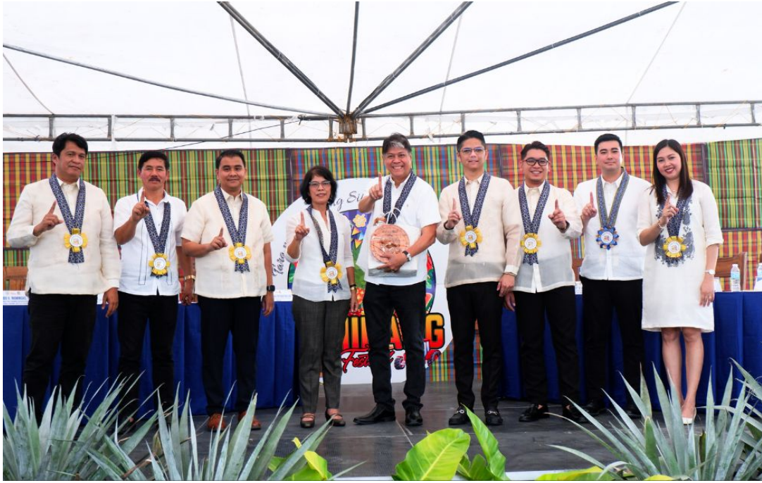
Guest of honor former senator Francis Pangilinan at Sumilang Festival in Silang, Cavite, on April 24