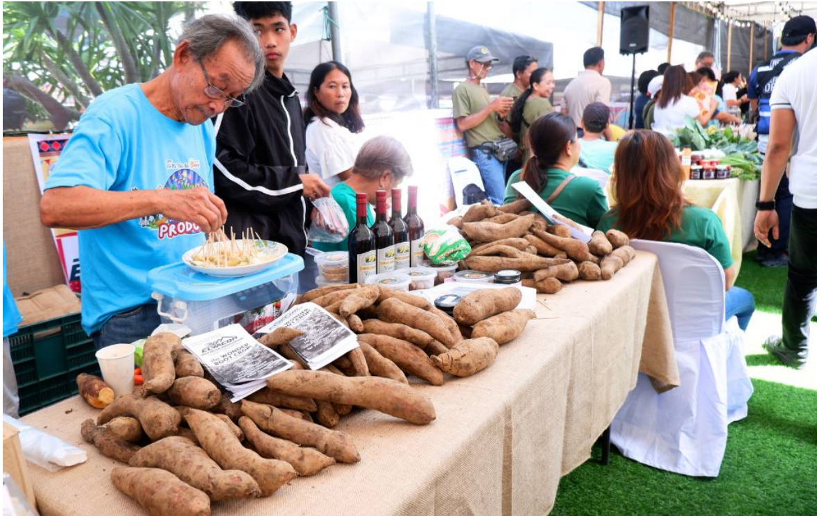
Farmers showcase their produce at the Sumilang Festival in Silang, Cavite, on April 24

“Hindi sila babaratin, tama ang kanilang kita, dadami ang ani, dadami ang huli, dadami ang supply ng pagkain sa ating mga merkado, babagsak na ang presyo ng pagkain, lahat tayo makikinabang (They will not be haggled down, their earnings are right, there will be more harvests, there will be more catches, the food supply in our markets will increase, food prices will drop, and we will all benefit).”