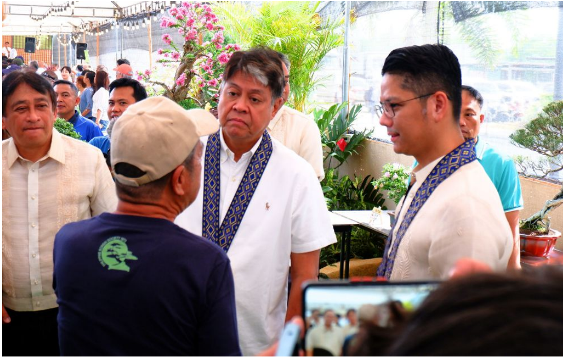
Mayor Kevin Amutan Anarna and former senator Francis Pangilinan at Sumilang Festival in Silang, Cavite, on April 24

Pangilinan, meanwhile, encouraged the municipal government to be a model LGU by fully implementing Republic Act No. 11321 or Sagip Saka Act, which provides an opportunity for farmers and fisherfolk to directly supply agricultural and fishery products to government agencies and LGUs without going through public bidding.