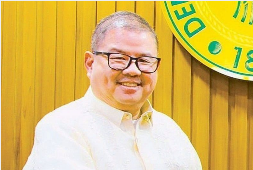
Francisco Tiu Laurel Jr.

MANILA, Philippines — Agriculture Secretary Francisco Tiu Laurel Jr. has allowed canners to import frozen bonito more than two weeks after he ordered a temporary import suspension of the fish, following reports that imported fish stocks are diverted to the wet markets.