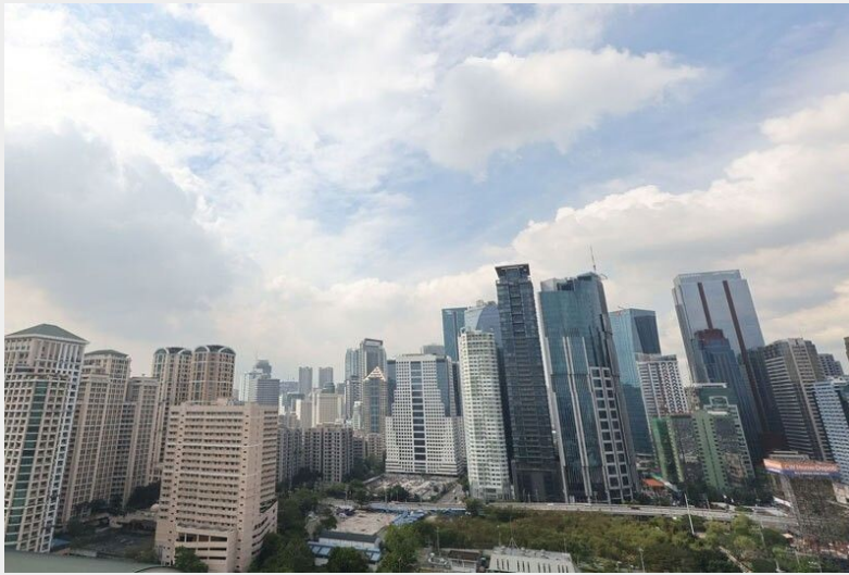
Photo show the skyscrapers of the Ortigas Center in the central business district as seen from Pasig City on January 9, 2024 afternoon.