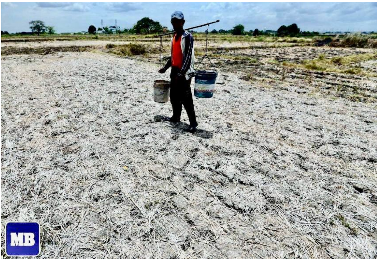
A farmland is all dried up due to the absence of rain amid the El Niño phenomenon.