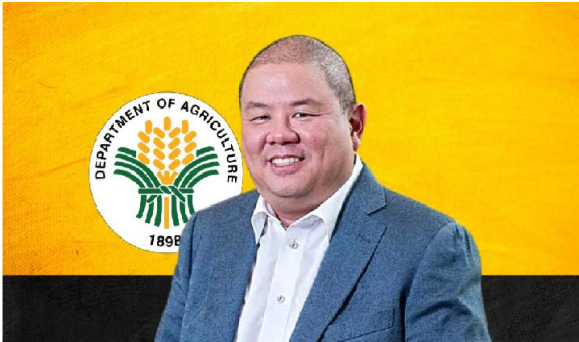
Department of Agriculture Secretary Francisco Tiu Laurel Jr.

AGRICULTURE Secretary Francisco Tiu Laurel Jr. has urged lawmakers to support the Rice Competitiveness Enhancement Fund (RCEF) extension.