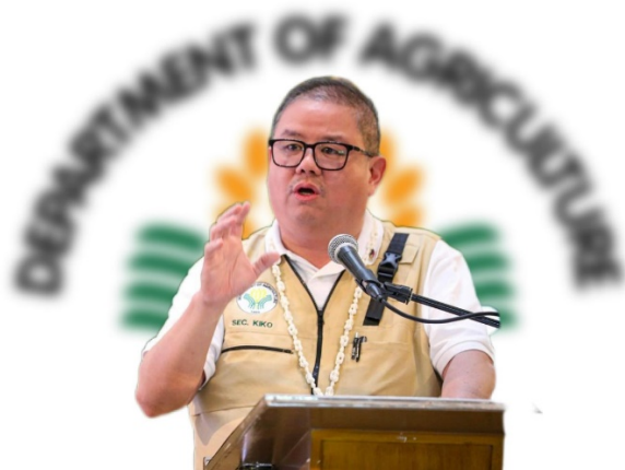
Agriculture Secretary Francisco Tiu Laurel Jr.

The Department of Agriculture (DA) on Tuesday, May 14, urged lawmakers to extend the Rice Competitiveness Enhancement Fund (RCEF) until 2030 as part of the government's goal of enhancing the livelihood of Filipino farmers.