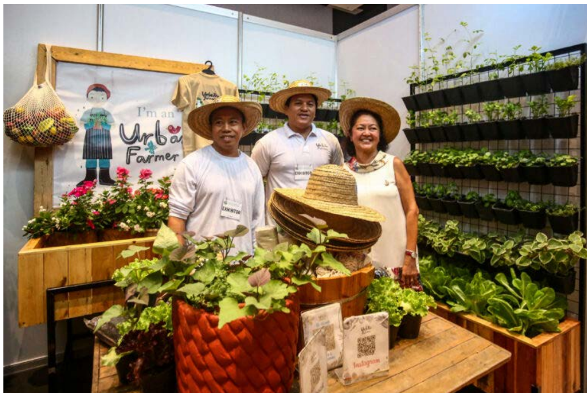
First Lady Louise Araneta-Marcos with some of the exhibitors