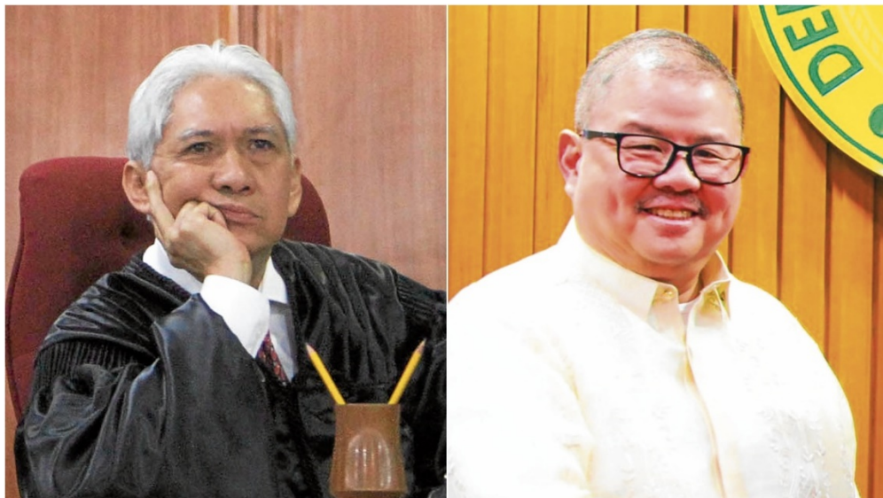
Ombudsman Samuel Martires and Agriculture Sec. Francisco Tiu Laurel Jr.

The suspended supervisors were assigned to NFA warehouses in the regions of Central Luzon, Calabarzon, Mimaropa, Bicol, Western Visayas, Central Visayas, Zamboanga Peninsula, Northern Mindanao, Soccsksargen, Caraga, and the Bangsamoro Autonomous Region in Muslim Mindanao.