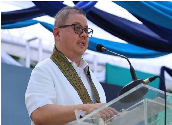
AGRICULTURE Secretary Francisco Tiu Laurel.

"El Niño really had its effect. The rain [season] is upcoming, and I hope there will be no strong typhoons. If there will be no strong typhoons then I think we could recover," Tiu Laurel said on the sidelines of Horticulture and Urban Agriculture Summit 2024.